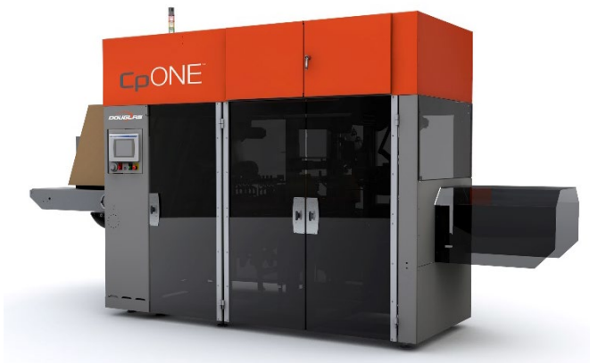
This Simplifies Everything.

We look forward to visiting with you in Booth S-2820 to discuss how Douglas can do more for you!