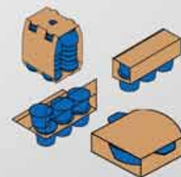
Typical Pack Patterns