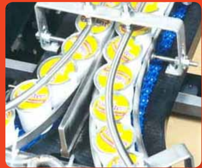
▲ Simple balanced lane product infeeds