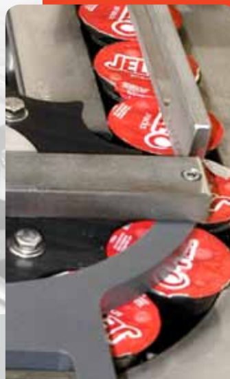
▲ Star wheels for soft products requiring surge control and spacing