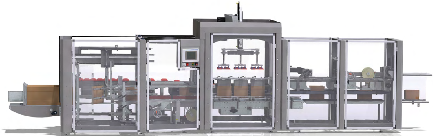
▲ TriVex® RLi pictured